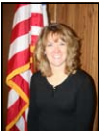
Misty Fairchild Mystique Salon & Day Spa