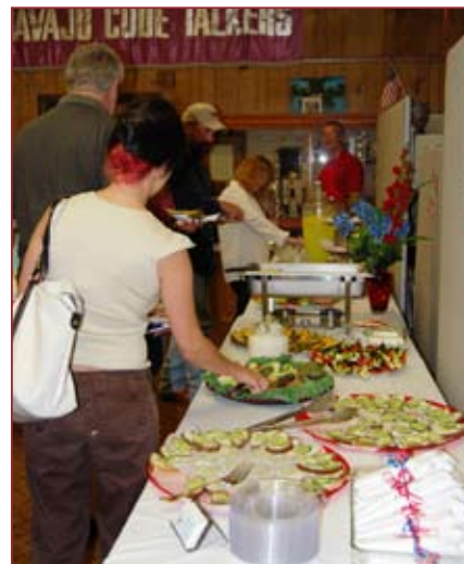
The Disney Pre-Party at the Chamber in June to Introduce the Disney Institute "Keys to Business Excellence."