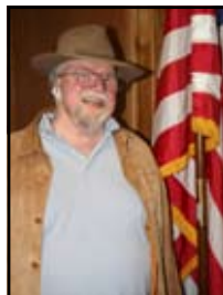
Jim Harlin Community Food Pantry