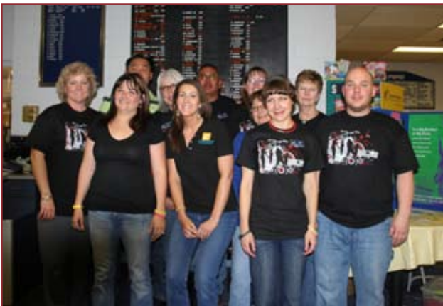
Smiling faces at the Big Brothers Big Sisters Bowl for Kids Sake in April at Gal-a-Bowl. This is the 2nd annual for the Gallup BBBS.